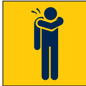
cough and sneeze etiquette